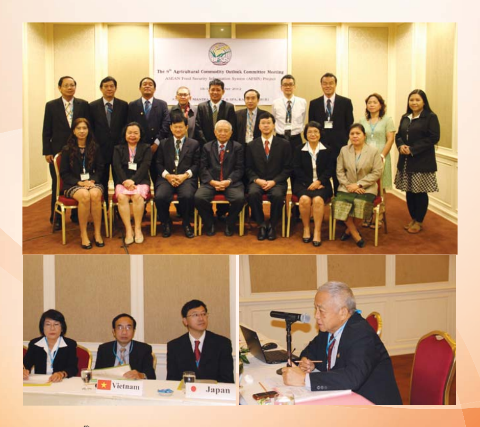
The 9<sup>th</sup> ACO meeting 18-19 December 2012, Kanchanaburi, Thailand

cassava. These reports will also be released bi-annually except the ACO reports will be published on June and December. The data content in ACO report are similar to EWI report with the balance sheet of each commodity, import and export, food security ratio, self - sufficiency ratio and FOB/ CIF prices are included. There will also be meetings of ACO Committee prior to publications so that member states are able to scrutinize the data and information for its accuracy and consistency.