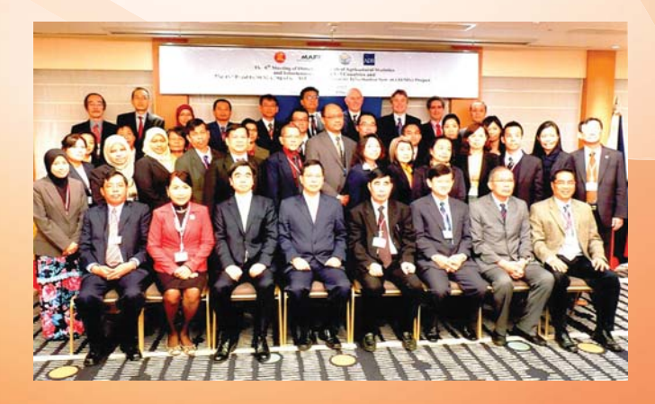
The 6th DG-ASI and 10th FP meeting during 14-16 March 2012, Tokyo, Japan

The FPM's objectives are to discuss and prepare work plans on both national and regional level including matters relevant to the project. The new AFSIS website and database need to be improved as the existing website was outdated and the database was lacked of an ability to relate the information. The lack of ability to relate data was overcome by adding the relational database management system (RDBMS) to the existing database. Members of the meeting were also urged to use social networking to promote the AFSIS. The AFSIS learning program's upcoming changes and new programmes to be implemented were also detailed. Furthermore, the Agricultural Land Information System (ALIS) which had been piloted in Lao PDR and Cambodia and is used to estimate land usage statistically was also discussed. The ALIS has great potential and AFSIS plans to update and use ALIS in the rest of 2012. Lastly, the 2012 work plan, the AFSIS structure, the products and services were then discussed and agreed upon. However, a need for further development was noted.